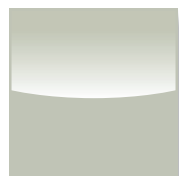
SGG 170 Light Grey