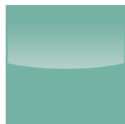
SGG 15 Mint Green