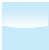
SGG 08 Light Blue