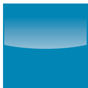
SGG 09 Aqua Blue