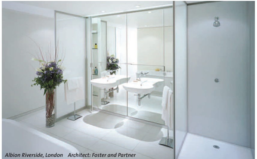
Albion Riverside, London Architect: Foster and Partner

Where the use of safety glass is required, a safety film-backed version is available, SGG PLANILAQUE EVOLUTION SAFE.