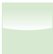
SGG 01 Almond Green