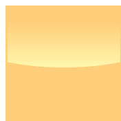
SGG 03 Solar Yellow