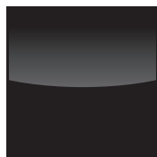
SGG 20 Black