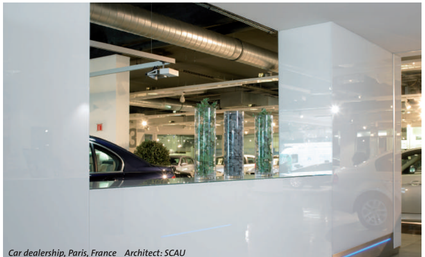
Car dealership, Paris, France Architect: SCAU