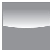
SGG 19 Titanium Grey