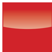
SGG 137 Flame Red