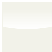
SGG 12 Extra-White