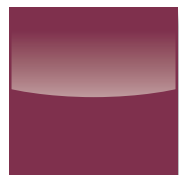
SGG 21 Opera Red